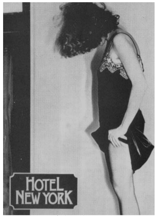
Hotel New York