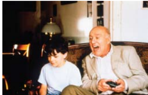
Michel Piccoli in I'm Going Home

Séverine (Deneuve) is young, newly married, and already bored with life. As violent fantasies interrupt the tedium of her life, she works in a brothel as a prostitute in this enduring and mysterious film by Buñuel.