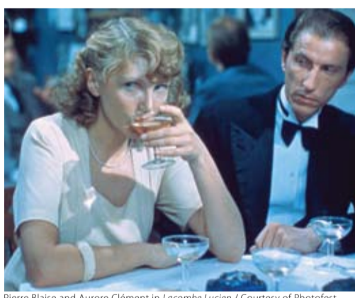
Pierre Blaise and Aurore Clément in Lacombe Lucien

author and film critic from the Chicago Reader .