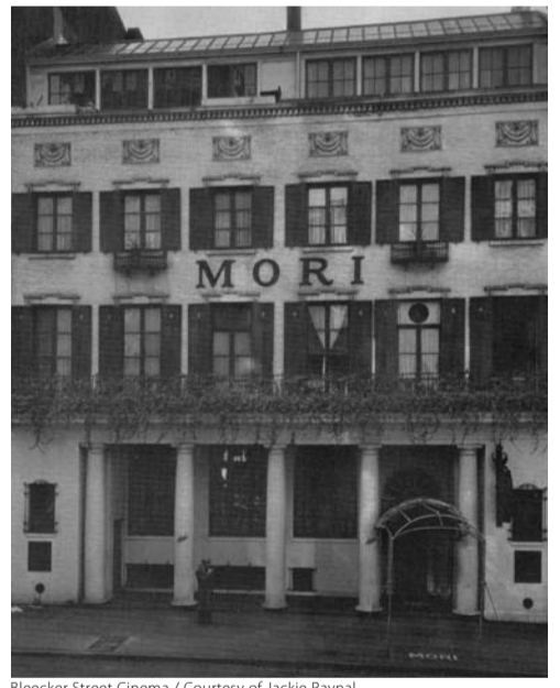
Bleecker Street Cinema