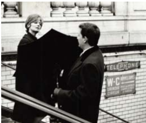
Six in Paris

of New York's Film Forum and founder of Rialto Pictures.