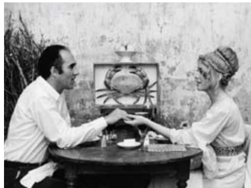
Michel Piccoli and Catherine Deneuve in The Creatures