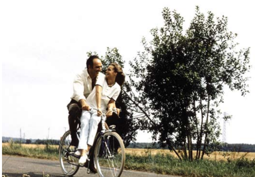
Romy Schneider and Michel Piccoli in The Things of Life / These Things Happen