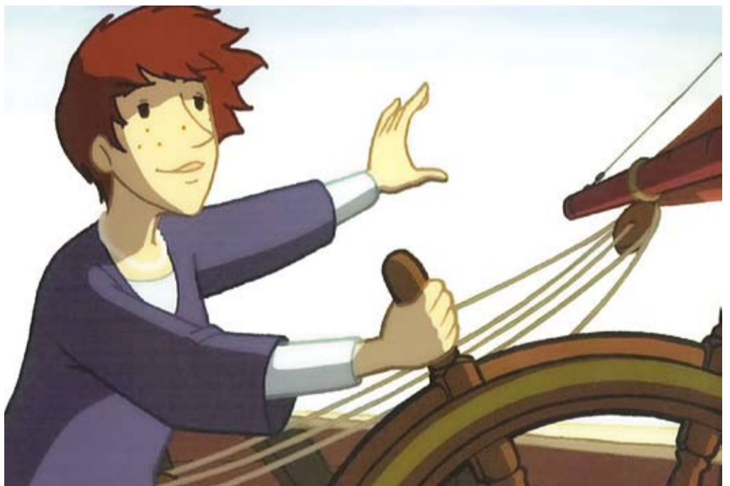
L'île de Black Mor