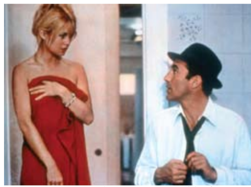
Brigitte Bardot and Michel Piccoli in Contempt

In the twilight of their careers, Piccoli and de Oliveira collaborated on this masterpiece about an aging actor who learns that he has lost his family in a car crash and must forge ahead anew.