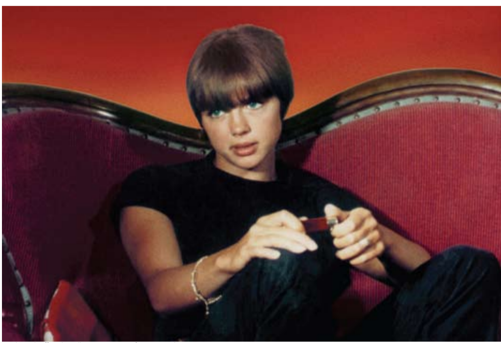
Haydée Politoff in The Collector