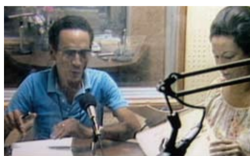
Jean Dominique in The Agronomist