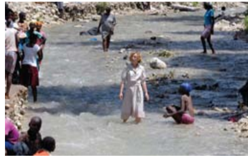
Sylvie Testud in Eat, for this is My Body

Rarely do debut features come along that are as assured as this meditation on colonialism and the evolving ethnic tension in Haiti. Themes of death, subordination, and revolt are all rendered through poetic images that feel refreshingly unique.